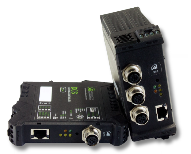
DCS-100E and DCS-103E Shown

Example light part number for DCS lighting controller: AL295-150WHIC1